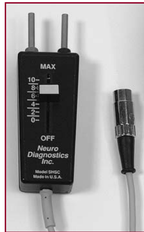
Stim Handle DIN