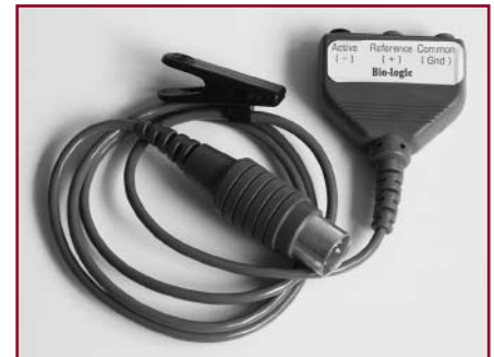
3 Port Patient Cable