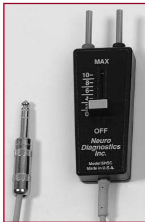
Stim Handle Stereo Plug