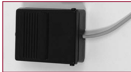
Foot Switch Assembly